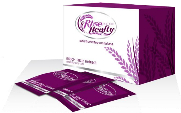
Fig. 2 Riceberry ready to drink powder packed in sachet and box form with brand name design.

The multiple regression techniques used to analyze with linear regression equation, the researcher input nine items of independent variables are the features Riceberry ready to drink powder. The dependent variable is the consumers' purchase intention (CPI) that tested significantly inside each feature of the new product concept.